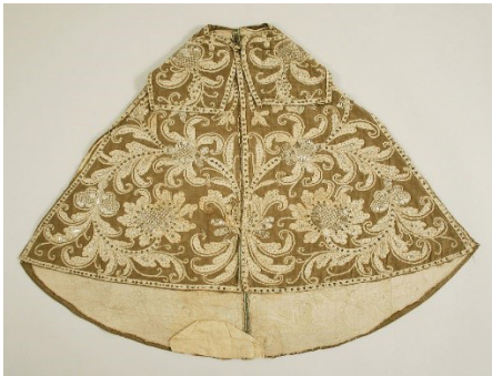
SILK Embroidered Spanish silk cape 17th century, Metropolitan Museum of Art