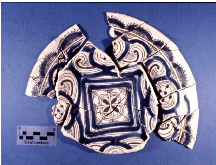
MAJOLICA PLATE Fragments Mission San Luis