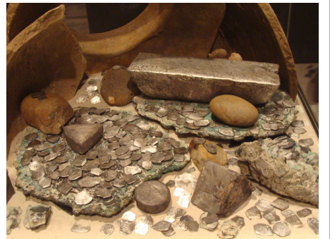
SILVER COINS & BARS Spanish Treasure Museum of Florida History