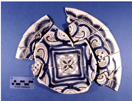
MAJOLICA PLATE Fragments Mission San Luis