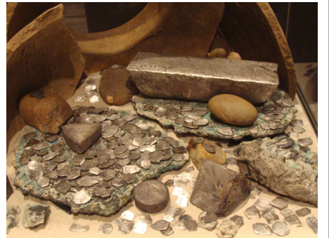
SILVER COINS & BARS Spanish Treasure Museum of Florida History