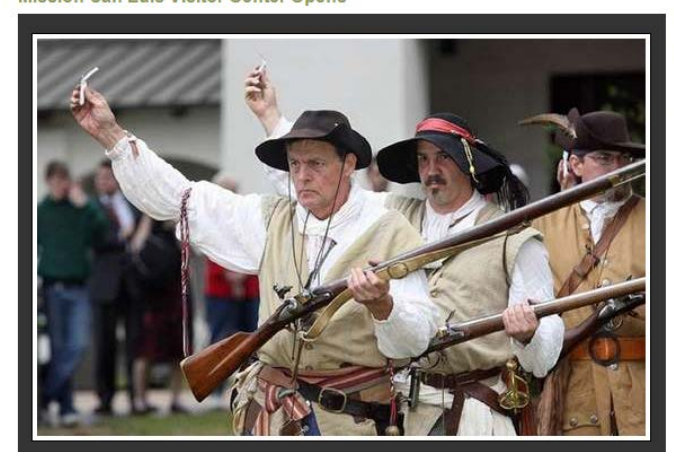
Mission San Luis Visitor Center Opens

Members of the Castillo de San Luis prepare to prime and load their muskets before firing them at the start of the Grand Opening