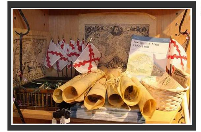
Replicas of old flags and maps are available for purchase in the gift shop during the Grand Opening