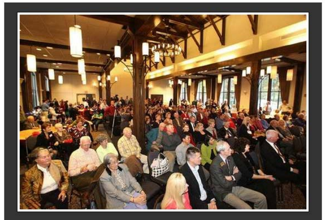
Mission San Luis Visitor Center Opens