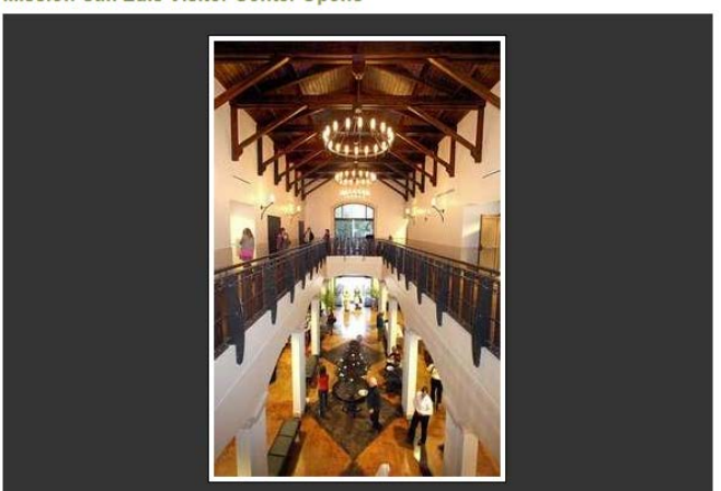
Mission San Luis Visitor Center Opens